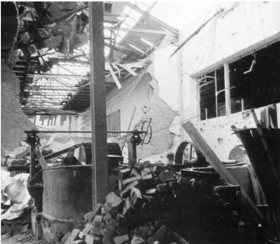
↑ More than two thirds of the Seitz plant were destroyed in a heavy air raid in January 1945.

Towards the end of the war the Holstein & Kappert operating division for dairy machines and equipment was evacuated to Zerbst in Saxony-Anhalt on the orders of the authorities. Not all of the wagons loaded with machines and valuable materials actually reached their destination, however. After the war the factory in Zerbst at first continued to operate under the name of Holstein & Kappert; the change in the political situation from 1962 onwards later left the Dortmund headquarters powerless to exert any influence. Other sections of Holstein & Kappert's operations were moved to a machine tool factory which had not yet been destroyed, a Krupp plant in Neuenrade in the Sauerland and Dortmund's prison.