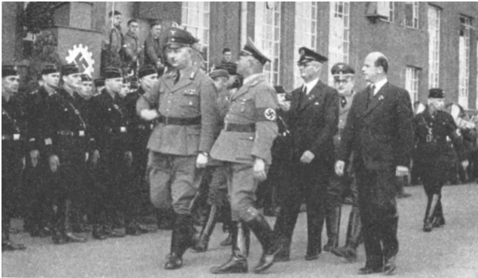
↑ Nazi officials march past the Seitz-Werke workforce assembled in rank and file for the occasion.

During the rule of the National Socialists the economy had the task of controlling and mobilizing society. On the one hand it had to satisfy the needs of the population so that the propaganda of the Third Reich could take its desired effect. On the other it had to create the right conditions for the planned war. Within just a few years of Hitler's rise to power unemployment dropped from six million in January 1933 to a yearly average of under one million in 1937. The regime claimed that the fact that the economy and the labor market in Germany had recovered much faster from the Great Depression than that of the other industrial nations was a notable outcome of its National Socialist welfare policies. The focus then quickly and permanently shifted to rearmament.