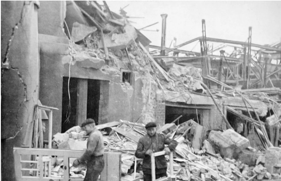
↑ Workers from Holstein & Kappert in Dortmund clearing the rubble on the site on Juchostrasse.