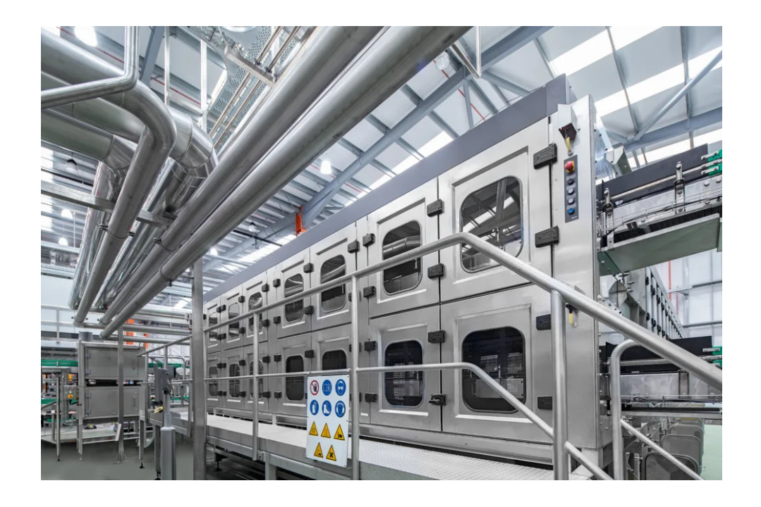
The extremely flexible Innopas SX pasteurizer permits very fast product changeovers and can be expanded at a later datethanks to its modular design.