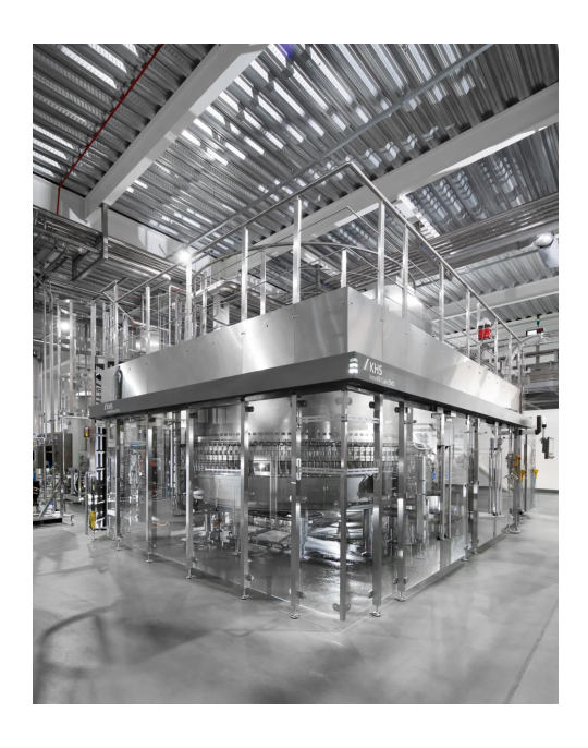
↑ One of Cawthray's experienced colleagues and former employees says of the Innofill Can DVD that it's the best he's ever seen.

selling the first plastic bottles in the British Isles and a little later was party to the successful launch of beverage cartons, operating one of the first two such lines in the UK.