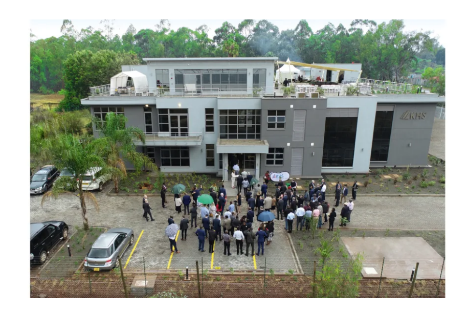
Over 2,000 square meters of office, warehouse and training space are now available at the new KHS East Africa site located on the outskirts of Nairobi